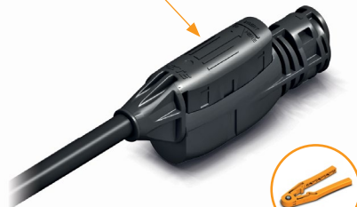
PRESS BUTTON (terminate cable)