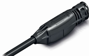
READY (fully closed)

Note: for detailed instructions, check Application Specification 114-133104