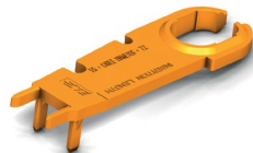
SOLARLOK delatch tool 2342988-1